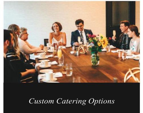
Custom Catering Options

Hotel Saranac, newly restored in heart of the Adirondacks, is steeped in history and surrounded by breathtaking views. Your special day will be made magical by the flexibility of our unique event spaces and offerings, customizable catering menus, on-site amenities including a salon, Barber, spa, and more!